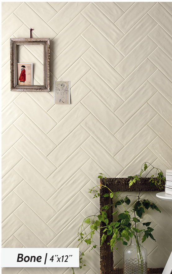
Bone / 4"x12"