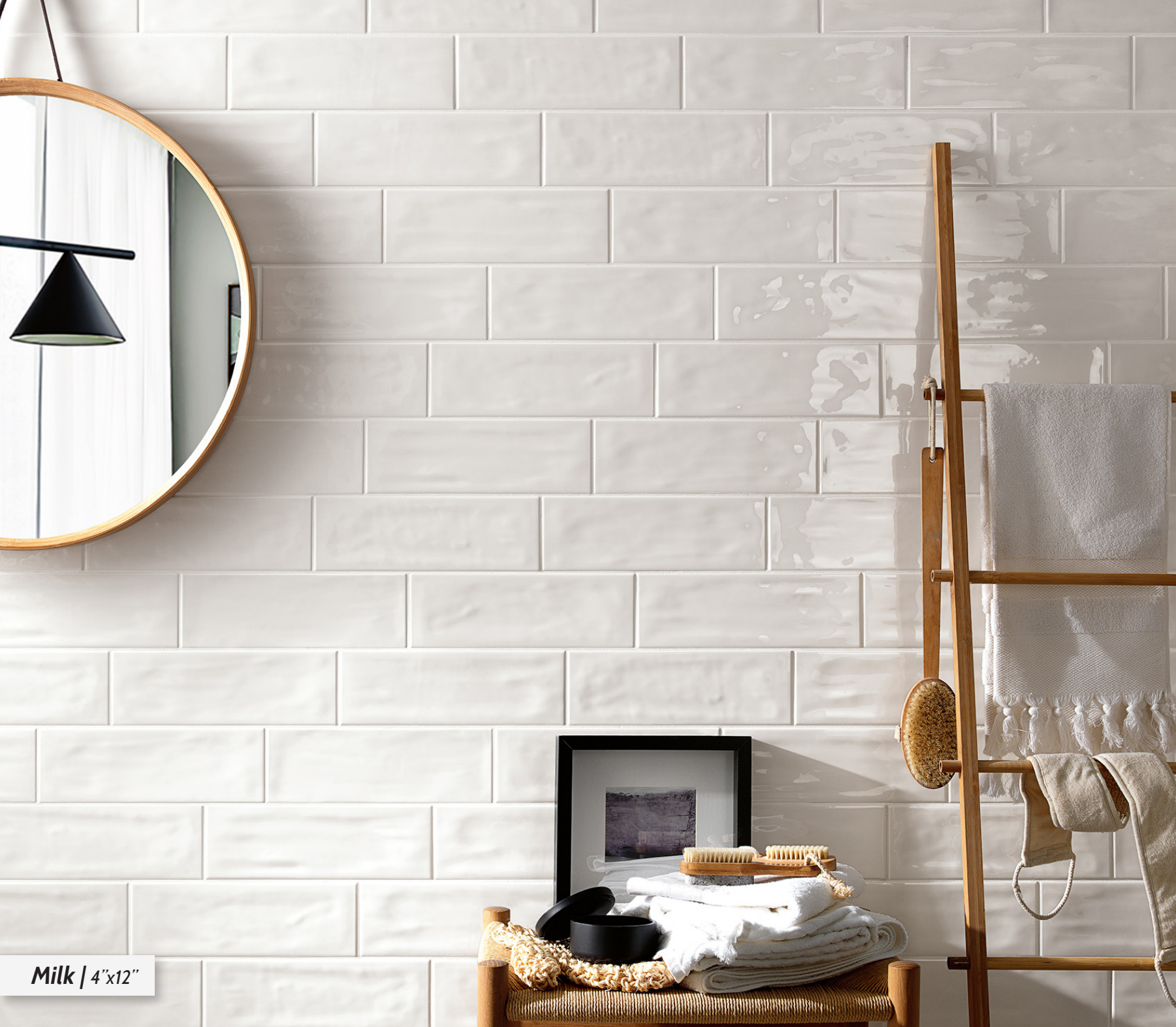
Milk / 4"x12"