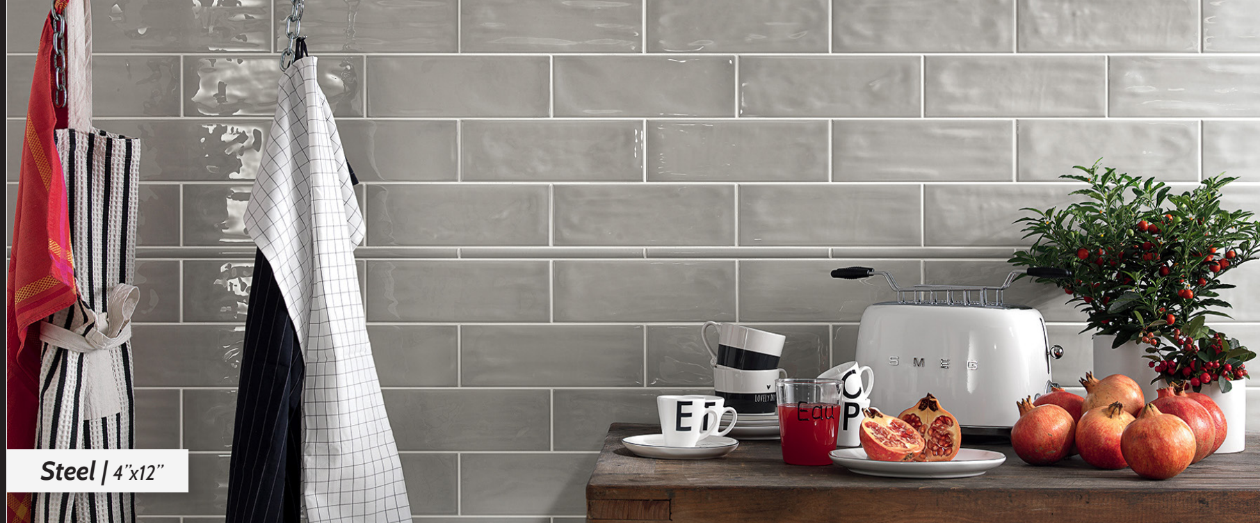
Steel | 4"x12"